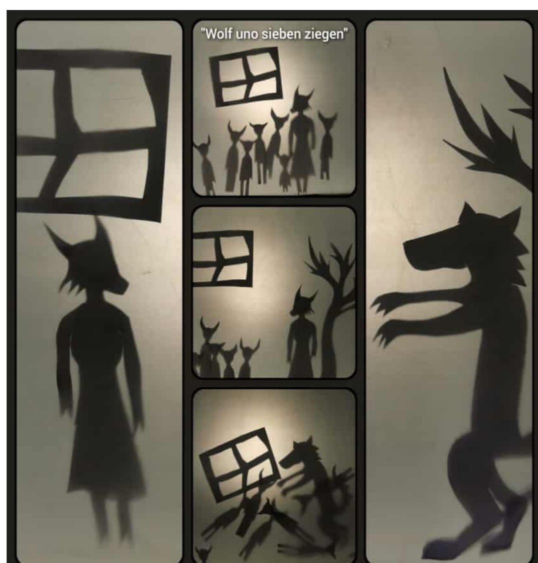
„Wolf uno sieben ziegen“