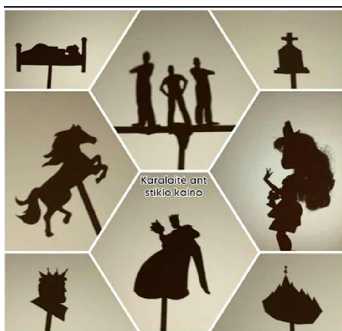
Karaliaite ant stiklo kalno

The project "Creative Language Business: Illustrations of Brothers Grimm's Fairy Tales" is intended to integrate literature, art, technology, foreign languages, creativity and entrepreneurship education. During the project, students have analyzed Lithuanian and German folk tales. They have created illustrations for their characters – they have photographed shadows with the "Collage Maker" collage app. The project consists of several creative stages: analysis of works, photography, photo editing, script development, presentation of a business idea, integration of rhetoric, creation of a book.