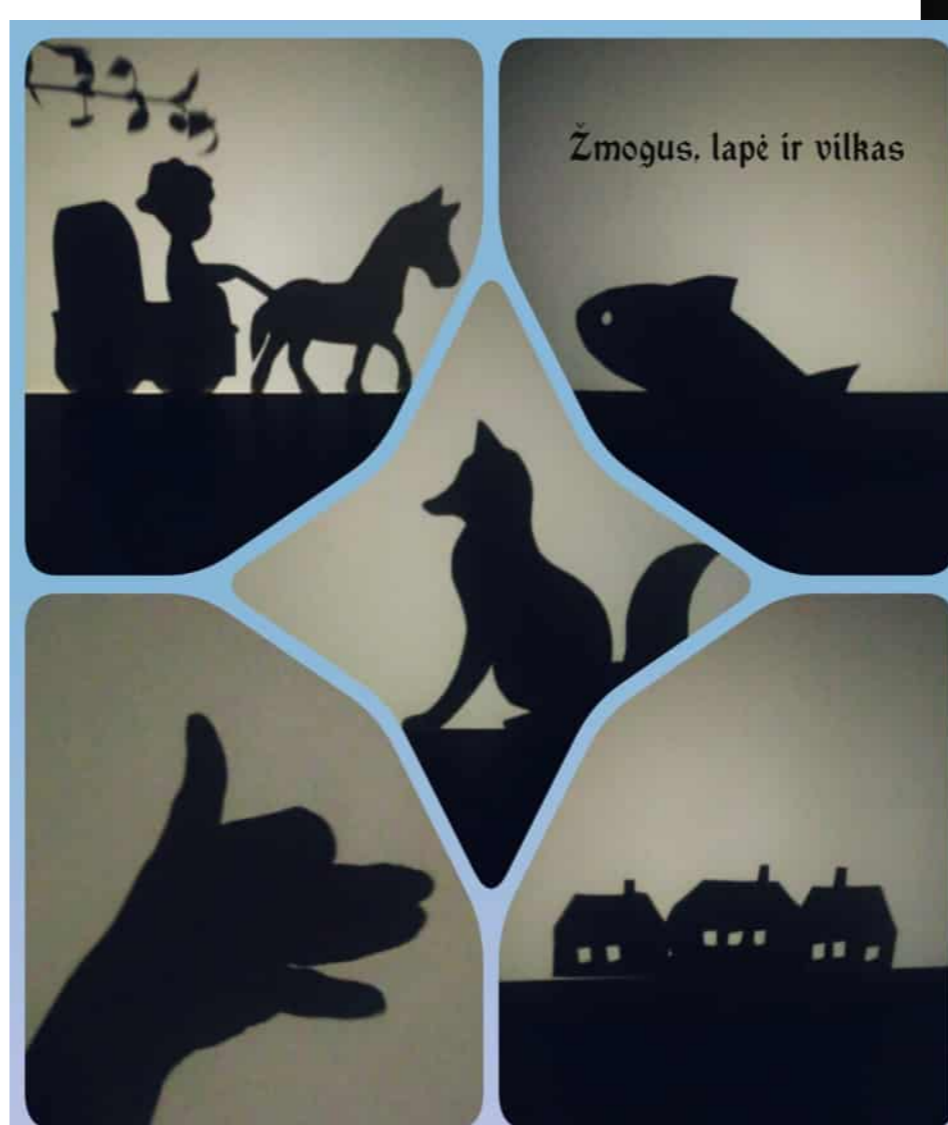
Žmogus, lapė ir vilkas