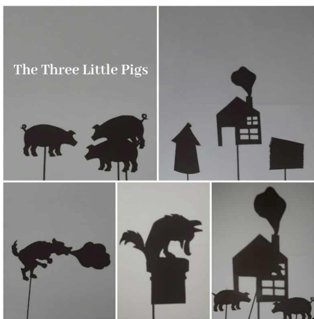
The Three Little Pigs

Creative activities encourage the creation of student's own projects, which not only give them the opportunity to apply the knowledge they have learned, but also encourage their creativity. Students become active creators, which enhances their understanding and ability to apply knowledge in practice.