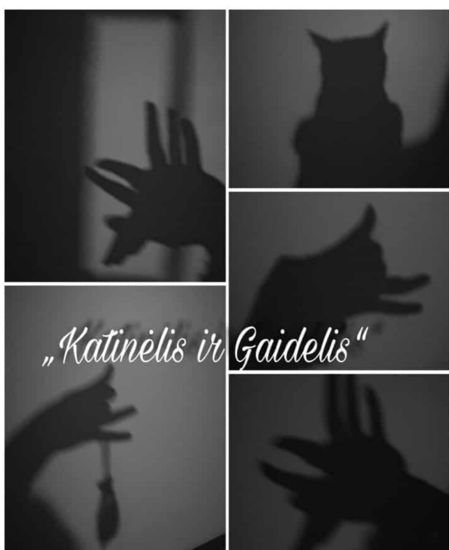
„Katinėlis ir Gaidelis“