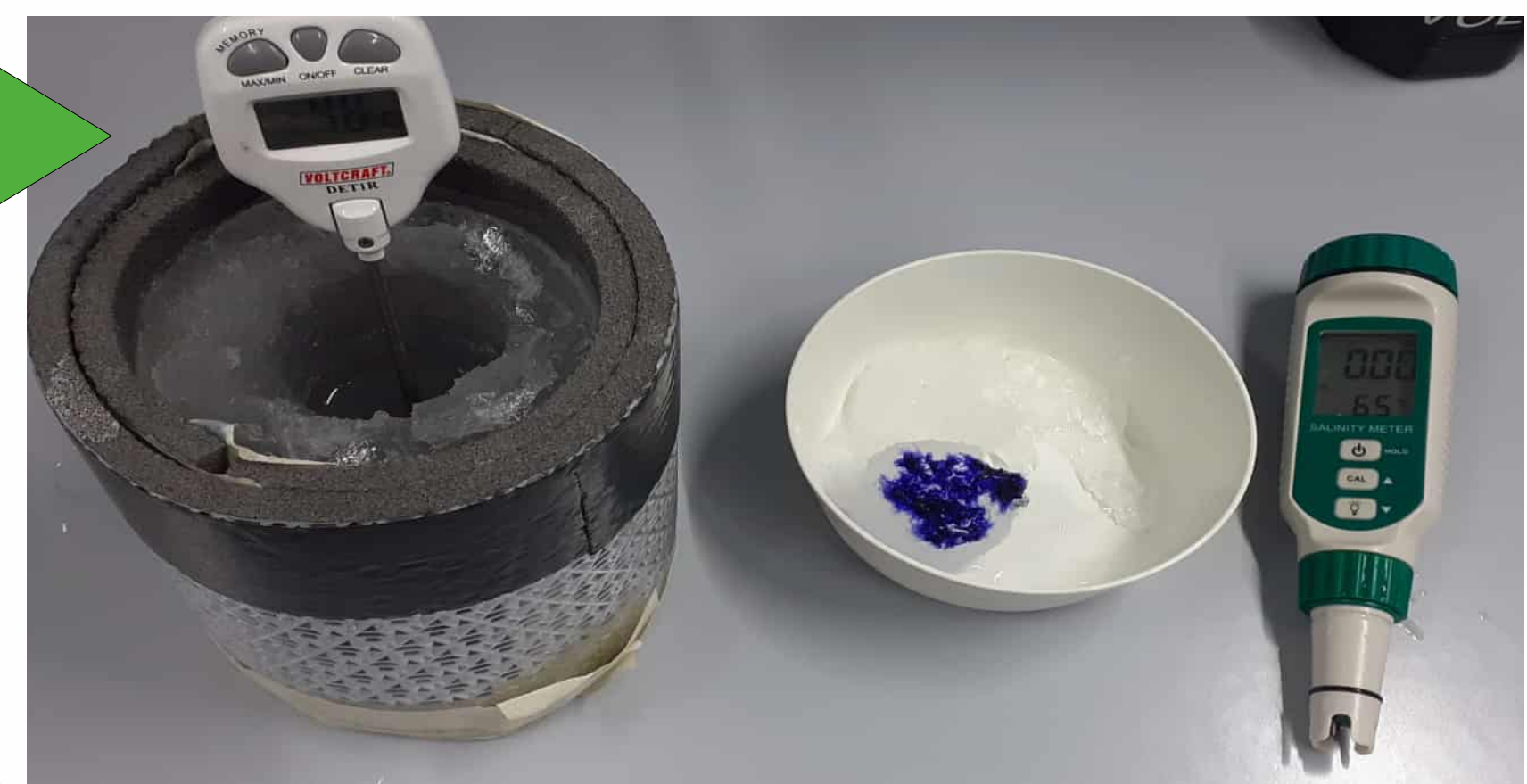
Drilling and analysing ice cores